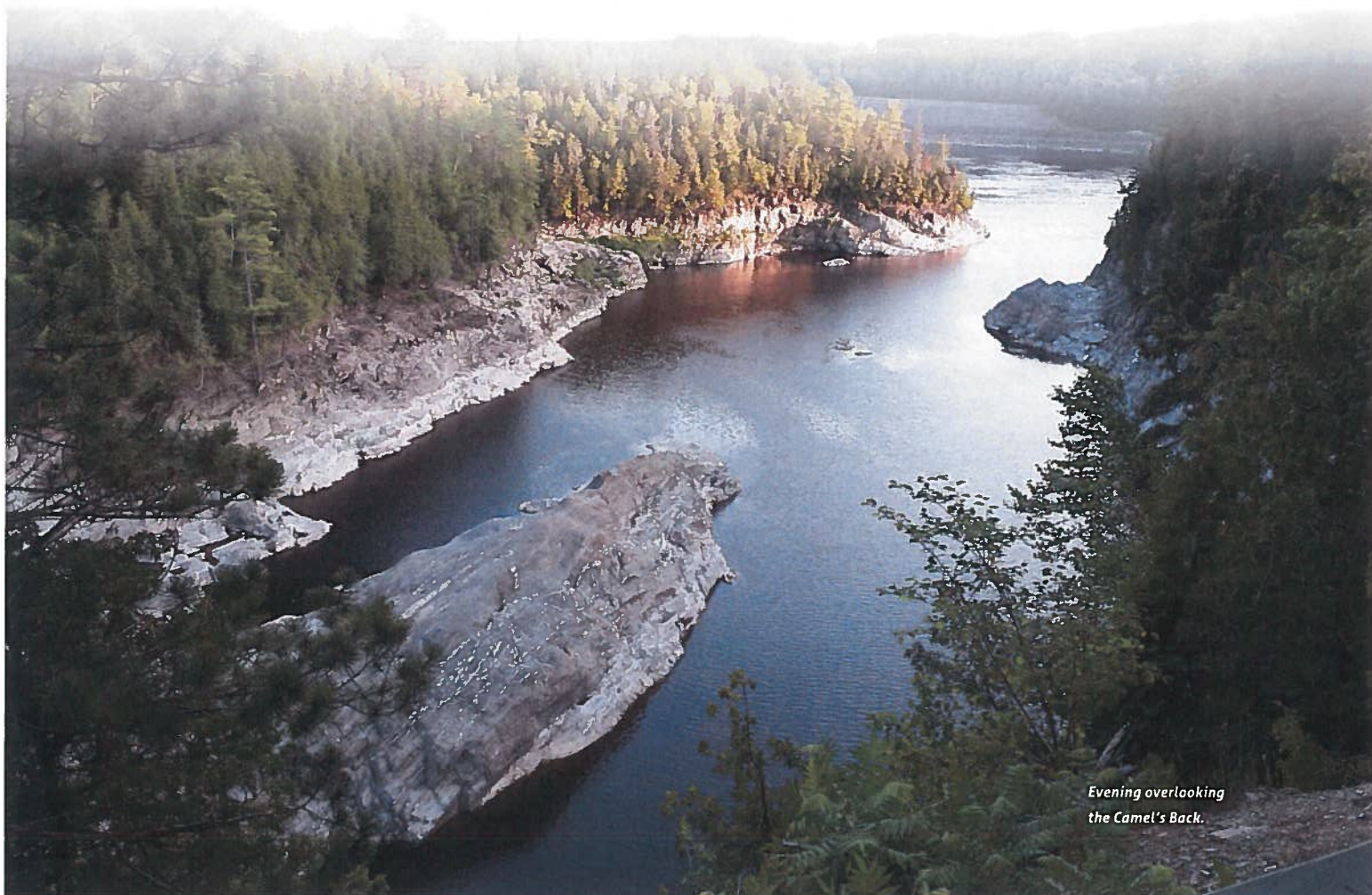
Evening overlooking the Camel's Back.

N OTHING HINTED AT THE INCONGRUOUS BEAUTY cutting through the town of Grand Falls in the Canadian province of New Brunswick as I drove through a typical urban setting—paved roads lined with stores and other businesses, and intersected with traffic lights to keep the inherent bustle organized. While looking for the town's namesake, my fur girl, Tessi, and I ended up at the Falls & Gorge Campground. The office worker, after providing directions, suggested I head over to the nearby fence. I could not have been more astonished as I beheld the vista beyond its boundary. It revealed a gorge with massive craggy walls bursting with rich woodland on top and cradling a river far below.